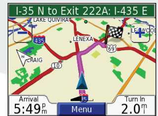
Big 3.5-inch color touchscreen displays map detail in 3D or bird's-eye perspective

Standard: Preloaded City Navigator North America NT data (full unlock) Vehicle suction cup mount A/C charger Carrying case 12-24 volt adapter cable Dashboard disk USB interface cable Sample language guide content (preloaded) Sample travel guide (preloaded for Europe only) Sample MP3s (preloaded) Sample audio books (preloaded) Quick reference guide Optional: GTM 10 FM TMC traffic receiver Garmin Language Guide Various Garmin Travel Guides Various SD cards preprogrammed with City Navigator NT data Dash mount Deluxe Carrying Case Remote GPS antenna