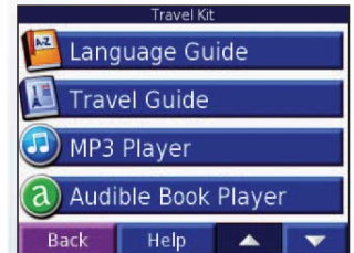
nüvi's Travel Kit™ holds an array of translation, tour guide and entertainment tools