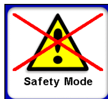
Safety Mode is on, at left, and off, at right.