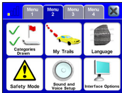
Page 2 of the Main Menu.